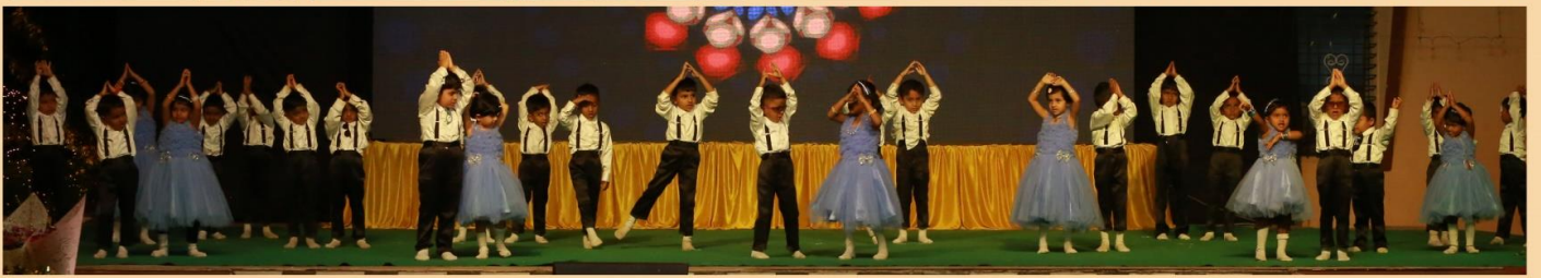
Astounding performances that mesmerised senses and made hearts sway by the little kids of Mary Matha