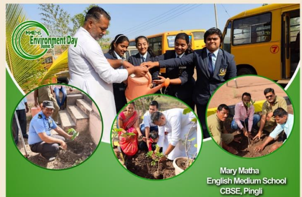
Mary Matha English Medium School CBSE, Pingli

On the 5th of June 2023, Mary Matha English Medium CBSE School organized Environment Day celebrations. How enchanting the exhibit was! The Principal, along with the other faculty members, students, and parents, participated in the program in full spirit. The aim behind organizing the Environment Day was to create awareness about the importance of keeping the environment clean as well as saving it. For this purpose, the school decided to conduct a 'Plant Trees Campaign' in which everyone was asked to plant a tree. To add beauty to the program Principal Father along with Mary Matha Marvels and their parents planted trees. As per the theme of this year: Solutions to plastic pollution, we the students are going to ensure that we will not cause any harm to the environment. To add to our celebration we had a wonderful skit presentation, speeches, etc which reminded and called attention to the negative effects of climate change and global warming. The day created everlasting memories which we will never forget.